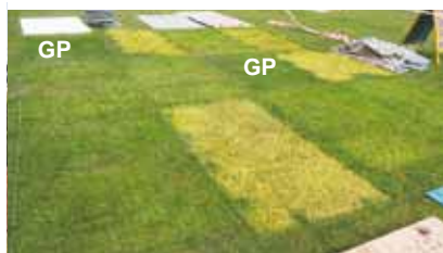
Official AGCSATech test report evaluation of Profloor products available on request.