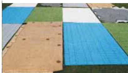
Official AGCSATech test report evaluation of Profloor products available on request.